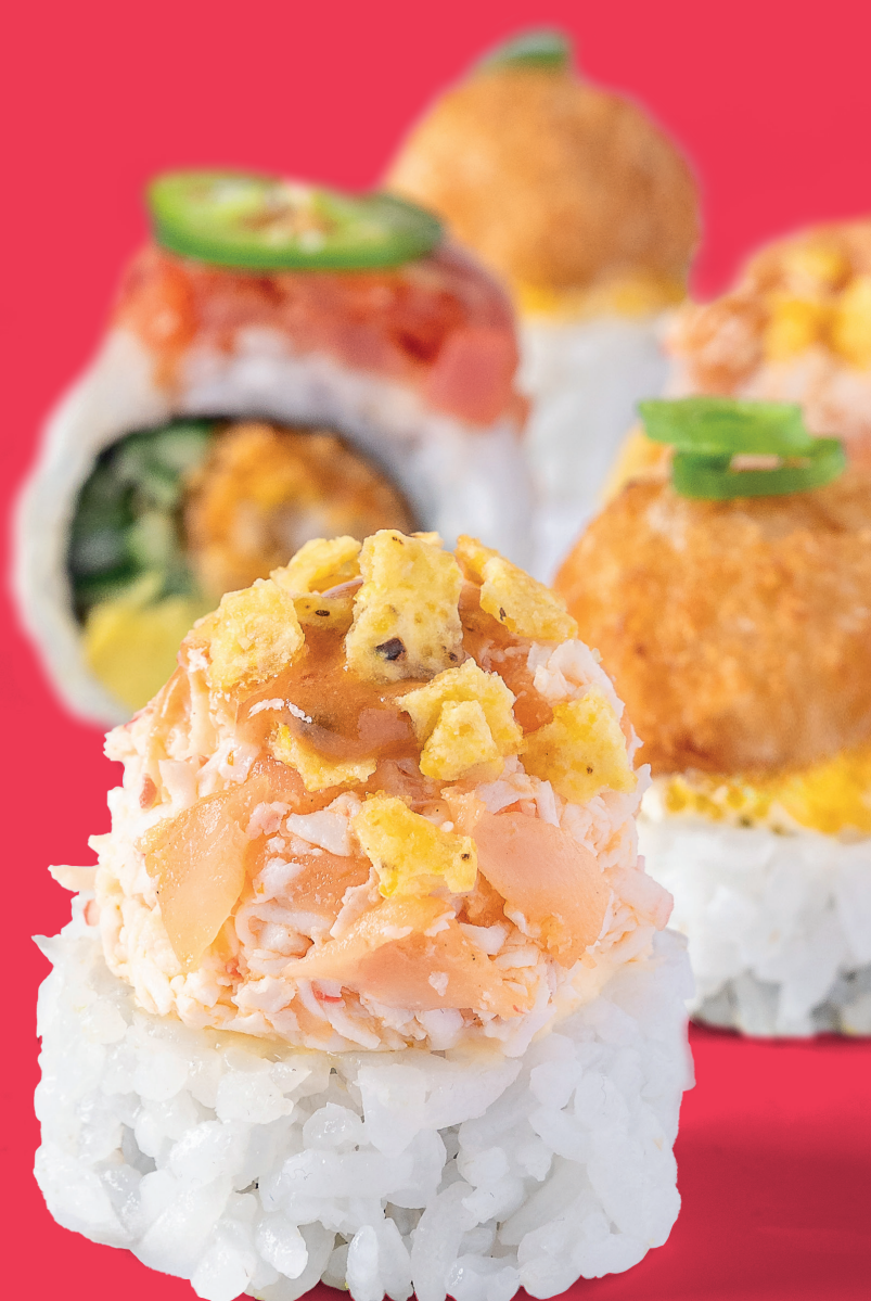
Photos are for reference purposes only. Menu français disponible en ligne à yuzu.ca.